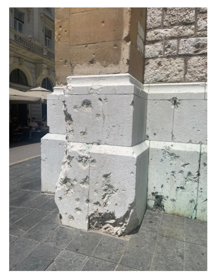
Figure 2: The Sacred Heart Cathedral in Sarajevo's city center. While much of the building's war damage has been repaired, bullet holes still chip away the cornerstone.

At a café, she tells me that remembering the war is part of her everyday life: "When I leave my apartment, I can see my elementary school where I studied during the war. In that school there are plaques of all the soldiers who were killed there, and one of the plaques has my father's name. When I'm going to the tram station, there is a monument of all of the names of the dead, and my father's name is there again. When I go to the [History] Museum, where I work, there's a wall where I can see my family name and all of the members of my family who were killed in massacres. My name is on a lot of buildings."