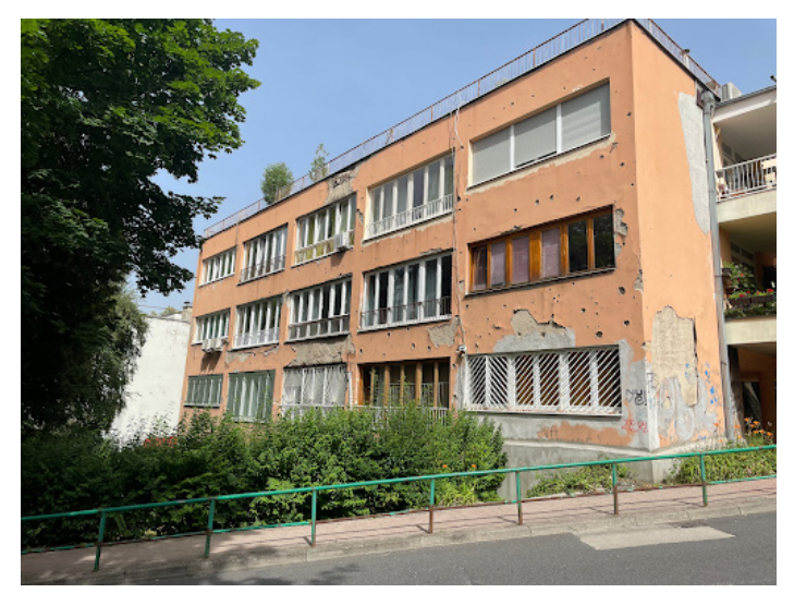
Figure 3: Bullet holes pierce the facade of an apartment building in the Mejtas neighborhood of Sarajevo.

could throw another grenade...."In these museums, the feeling of war triumphs over the hard facts.